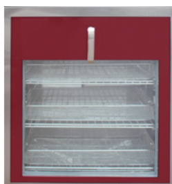
Toughened glass door