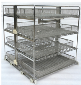
Standard cleaning rack

Pre-cleaning → Clean with enzymes → Rinse → Thermal disinfection → Glazing clean → Drying